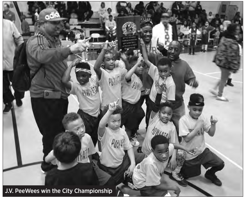
J.V. PeeWees win the City Championship