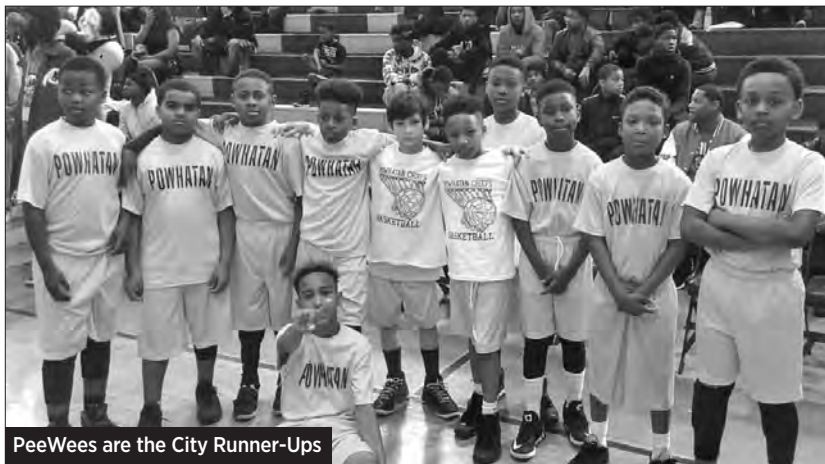
PeeWees are the City Runner-Ups