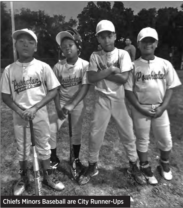
Chiefs Minors Baseball are City Runner-Ups