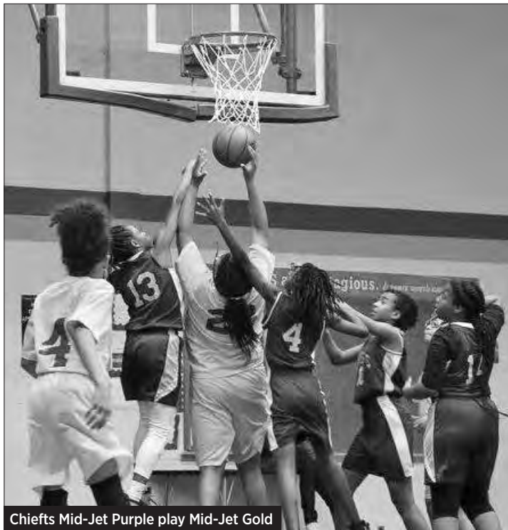
Chiefs Mid-Jet Purple play Mid-Jet Gold

We ask that anyone interested in coaching (volunteering) contact the center. All coaches go through criminal background checks and will be certified by the N.Y.S.C.A. (provided by the City of Richmond). Only serious applicants need apply to volunteer.