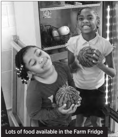
Lots of food available in the Farm Fridge

T he Garden Program at the Neighborhood Resource Center of Greater Fulton is growing! Last July, the NRC canvassed the neighborhood about local community gardening. We learned that many members of the community couldn't get out of their homes to garden for themselves. Thus the plans for the Garber Street CSA Garden began. A CSA, which stands for Community-Supported Agriculture, usually entails an annual fee per customer for delivery of produce to his or her front door on a weekly basis. The mission of this garden is to provide elderly and homebound community members with access to healthy produce. Are you interested in receiving produce delivered to your doorstep for a small fee (less than $50 a year)? See below for contact details! The garden will be constructed this fall and will be maintained predominantly by volunteers.