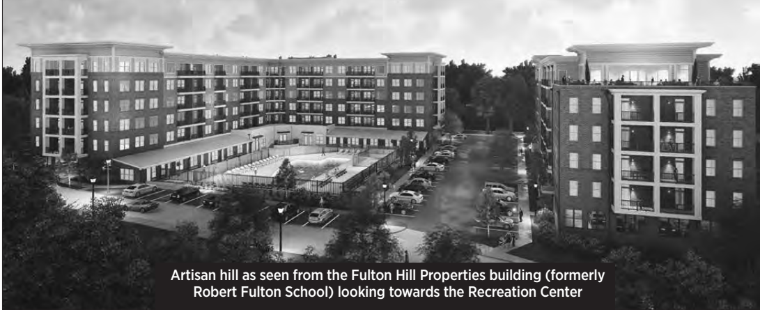
Artisan Hill as seen from the Fulton Hill Properties building (formerly Robert Fulton School) looking towards the Recreation Center