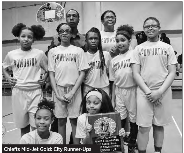
Chiefs Mid-Jet Gold: City Runner-Ups

ACTUAL SCHEDULE MAY VARY DUE TO ADDITIONAL PROGRAMMING