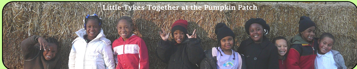
Little Tykes Together at the Pumpkin Patch

mentor, and complete a craft with materials all themed around the letter of the week . Many people may not be aware that with the addition of Little Tykes tutoring, CHAT now serves over 50 youth on average per week at two separate tutoring sites. A big thanks to the Strickland's for re-opening their home for tutoring and Ashley Hall , a weekly CHAT volunteer and mastermind behind the planning of Little Tykes.