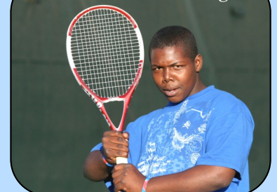
Tennis Lessons at Collegiate