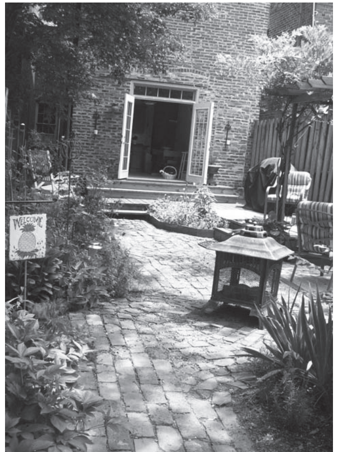
Figure 3 - Honorable Mention – 418 N. 27th Street – For its creative use textured greenery and flower, old brick paving and U-shaped deck with arbor creating a welcoming outdoor dining area.