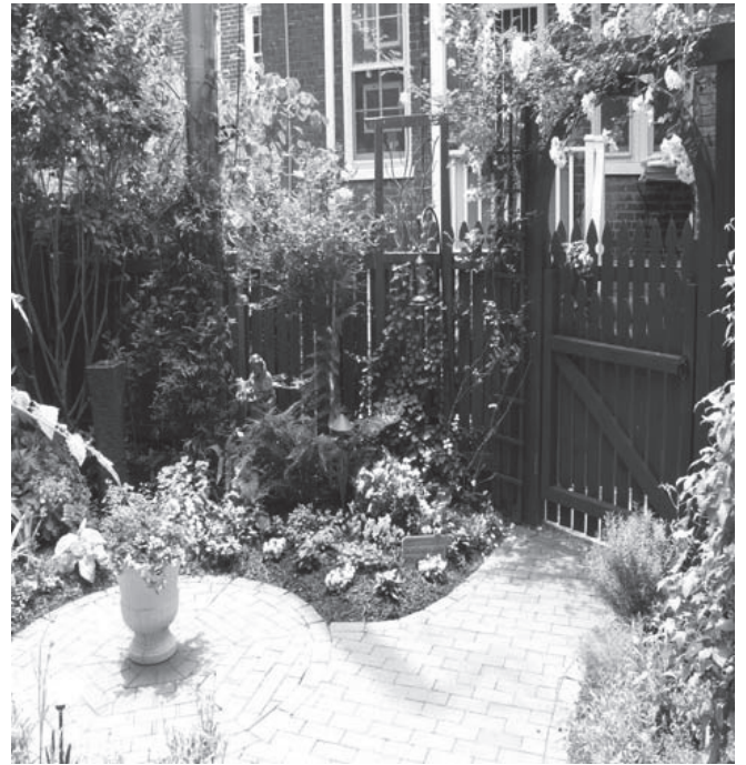
Figure 1 - Most Inspired Garden -2705 East Broad St. - a very charming, inspired use of water feature, statuary, urn, brick paving, asian inspired wooden gate with fantastic use of plant variety and texture; creating magic in very small space

The Planters thank Scott MacGregor for his able judging.