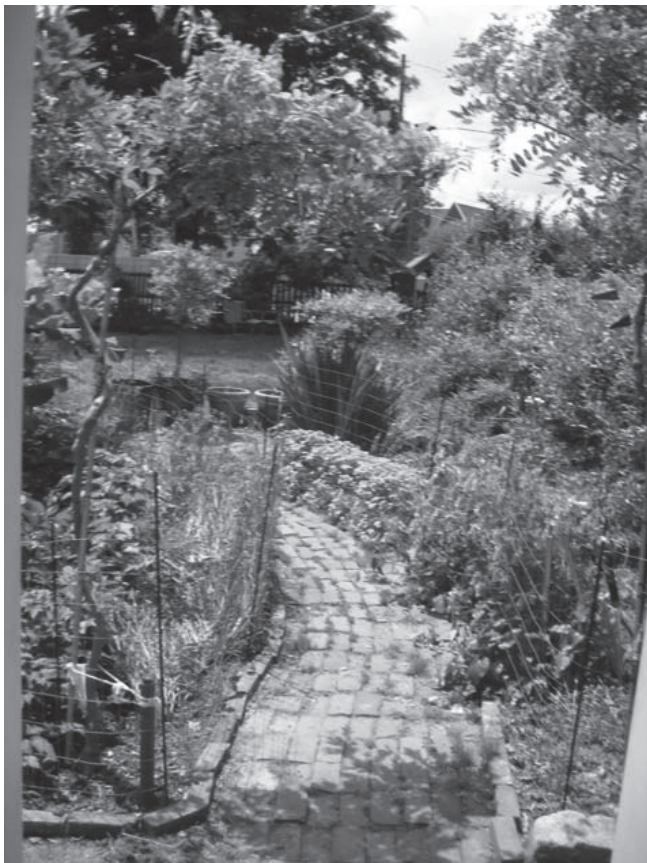
Figure 1 Golden Trowel Award winner is the back garden of Ann Wortham's at 23 rd and Venable - a green oasis in a very urban setting, with a large tree breaking up the brick houses at rear, an ambitious and tenacious reclaiming of a urban lot; creating the feel of a country garden.