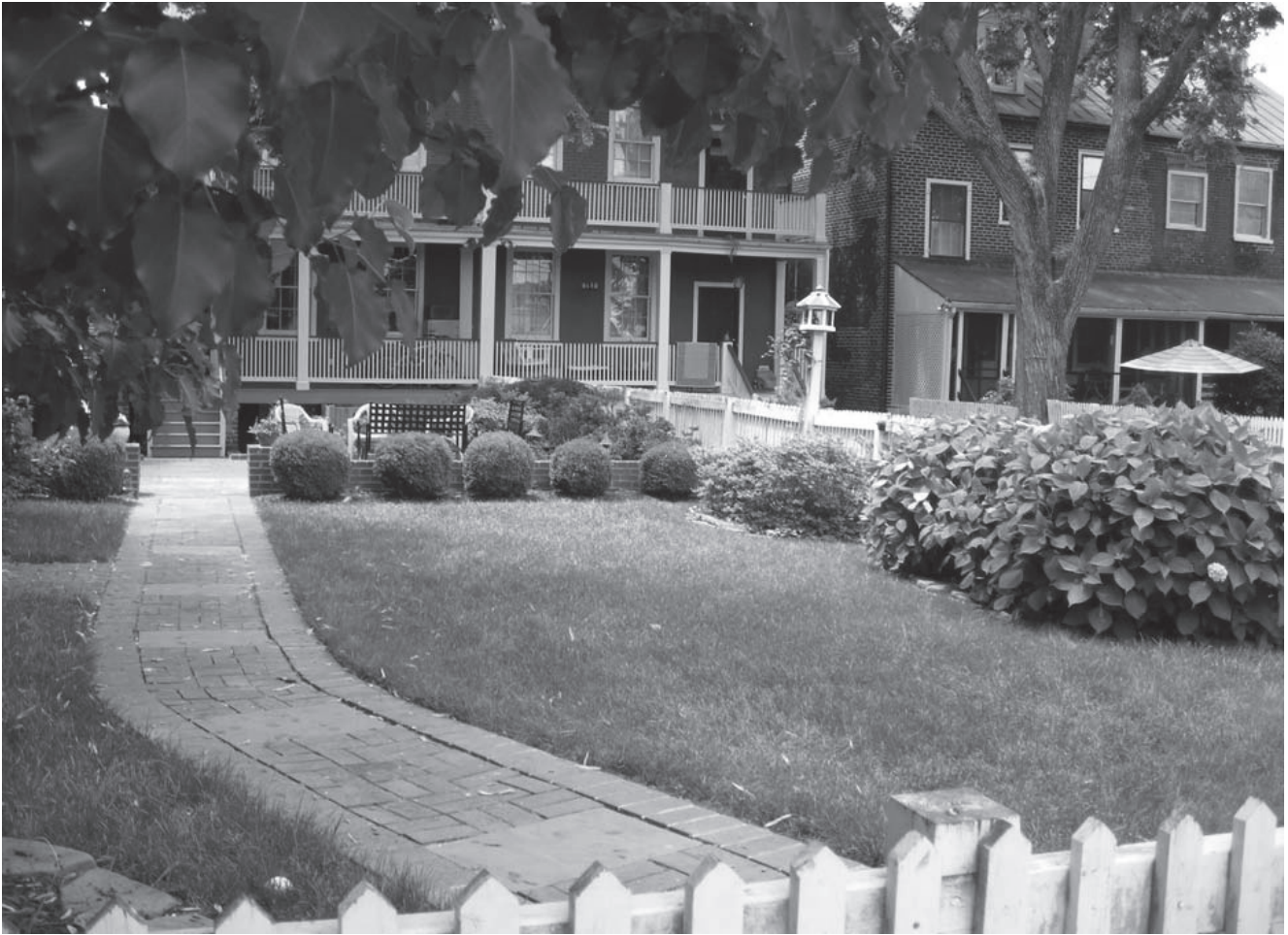
Figure 4 Most Inspired Block - the back gardens of 2206, 2208, and 2210 E. Broad St. Large shared trees, symmetrical plantings, a sure use of hardscape - brick and flagstone walls and walks - and handsome low neighborly picket fences, give a sense of space and a welcoming green retreat to three urban linear yards.