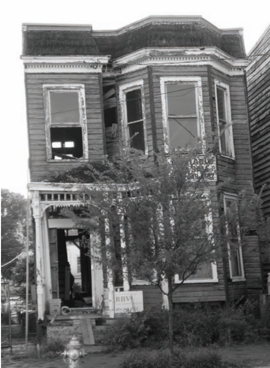
2200 East Marshall

Saving Old Buildings is the heart of “GREEN CONSTRUCTION”