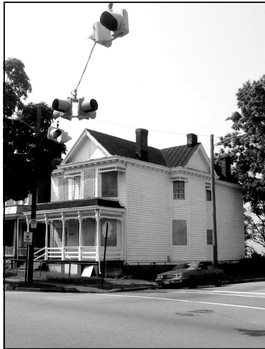
VACANT 2001 Fairmount Ave. Owned by Mount Tabor.