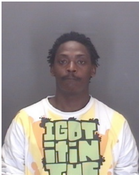
Darius Washington Burglary