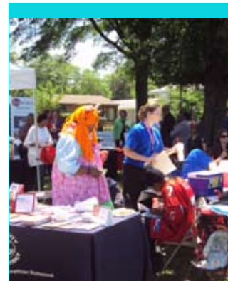
Whitcomb Resource Center Page 2