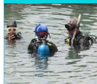
RRHA Youth Scuba Divers Page 4