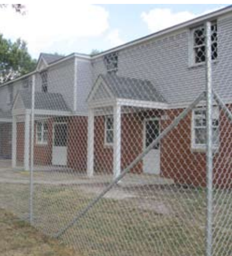
Creighton Court is lined with construction fencing during the upgrades.