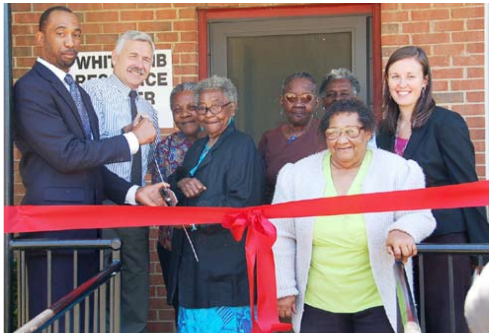
RRHA, Whitcomb residents and Richmond City Health District officials cut the ribbon at the grand opening.

In addition to enjoying health vendors and various grand opening activities, residents took advantage of free immunizations and other important health screenings. Another highlight was the planting of vegetables and flowers in a community garden, sponsored by Leadership Metro