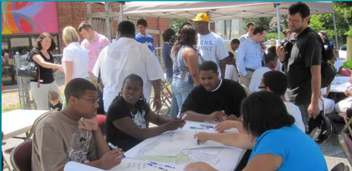
East End youth discuss community design concepts at a children's charrette organized by the City of Richmond, Bon Secours Richmond Community Hospital and RRHA. The charrette was part of a series of public meetings to seek input from the community, business owners, public housing residents and other stakeholders in building a more vibrant Church Hill/Nine Mile Road corridor and East End Community.