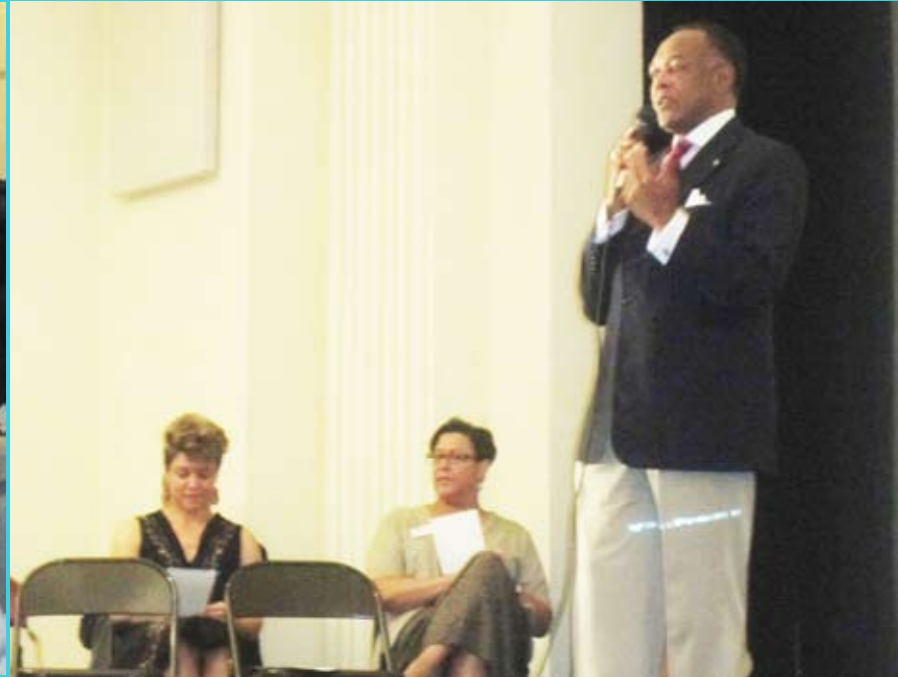
Richmond Mayor Dwight C. Jones spoke to students during the kickoff of the Youth Urban Conservation CORPS, a Mayor's Youth Academy program designed to involve more than 100 Richmond youth in an intensive horticulture and business development experience. Many of RRHA's youth from the East End will participate.