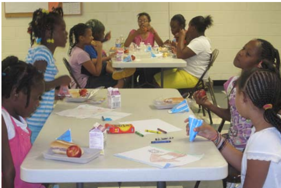
Mosby youth enjoy games and lunch as part of the summer activities.