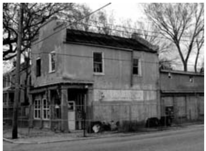
The store in 2008

In 2004 it was sold after being condemned by the city, and the new owner immediately gutted the building only to find out how age and lack of proper maintenance can destroy a structure. It sat open to the elements until