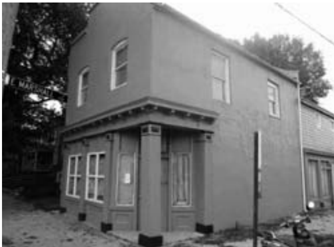
The current state of the store

were submitted to the C.A.R., but various interpretations of their own rules and requirements were again in play. An apartment was constructed on the second floor after walls that were meant to be salvaged (per requirements) were instead completely torn down and rebuilt. Parking was an issue with the change of use from a Laundromat to a proposed Restaurant, requiring off-street parking prior to the PE5 2010 zoning change. The owner and the city agreed upon a restoration plan, which was to be completed in June of 2009. The deadline was not met, and the owner was summoned to court in September over seven violations to be fixed within 45-days. Only a few of the violations were fixed before there was an ownership transfer to current owner Lessie Marie Hembrick. The building was put up for sale for $500k (fair value assessment value was estimated as $105k).