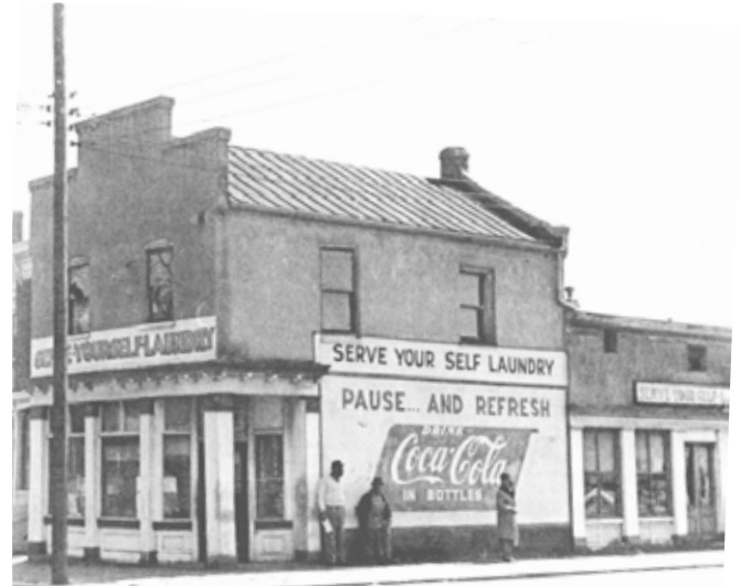
View of the store before 1964