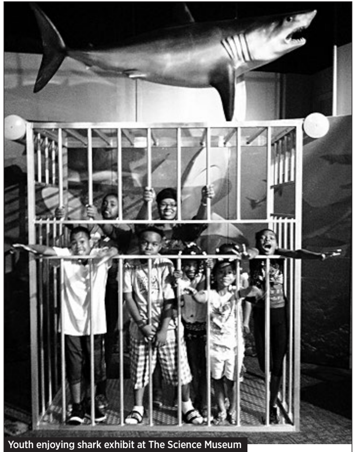
Youth enjoying shark exhibit at The Science Museum

The NRC's After-School Program hosted a great end of the year party to wrap things up in June! Special musical guests River City Taiko joined us to perform an interactive drumming set with our preschool and after-school families. On June 23rd, we launched our summer youth program, which serves free meals to anyone aged 18 and under and offers tutoring, classes, and bi-weekly field trips all summer long through August 22nd. These included field trips to the Science Museum, the Children's Museum, and Lewis Ginter Botanical Garden.