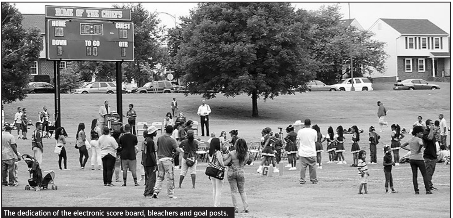
The dedication of the electronic score board, bleachers and goal posts.