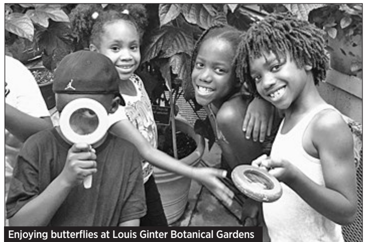
Enjoying butterflies at Louis Ginter Botanical Gardens