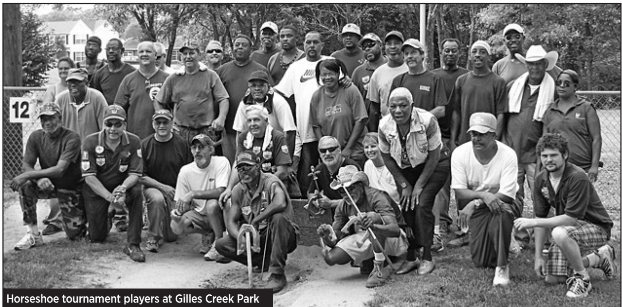
Horseshoe tournament players at Gilles Creek Park