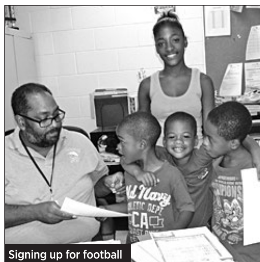
Signing up for football