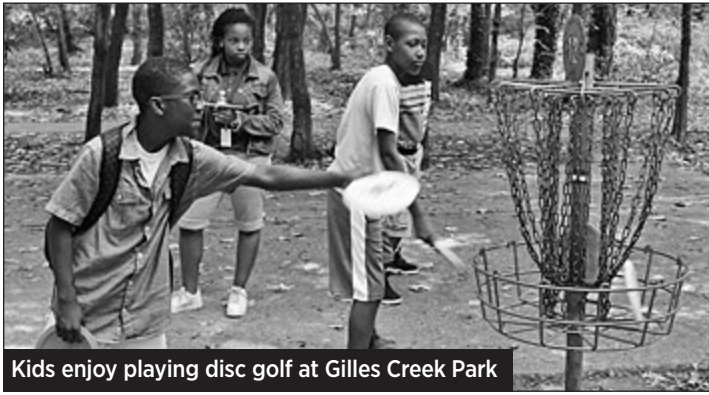
Kids enjoy playing disc golf at Gilles Creek Park