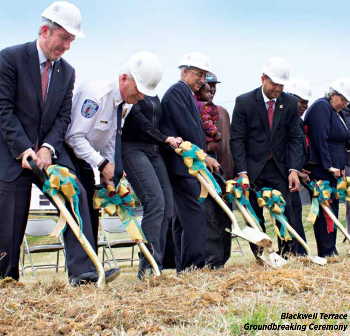
Blackwell Terrace Groundbreaking Ceremony