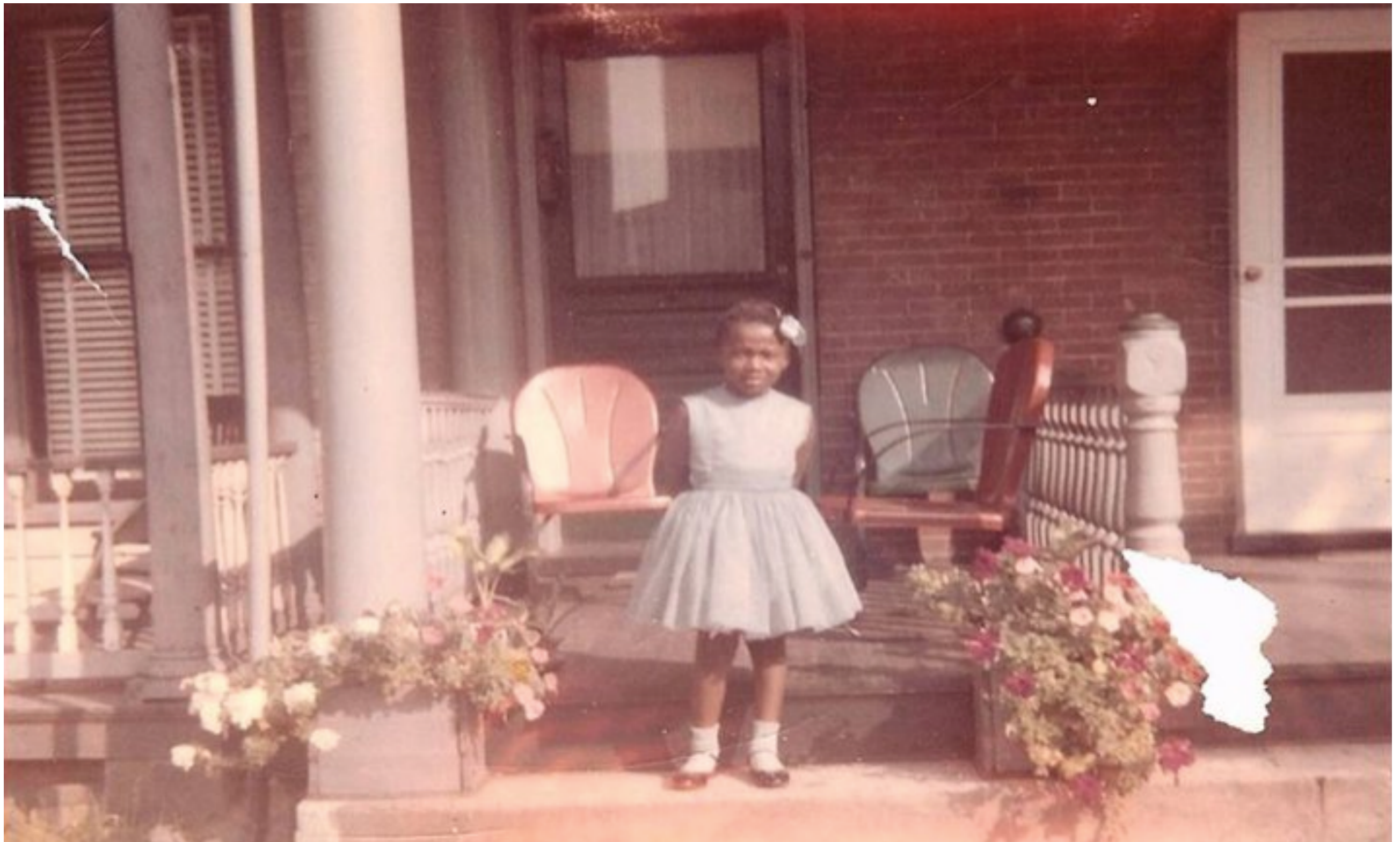
North 33rd circa 1970