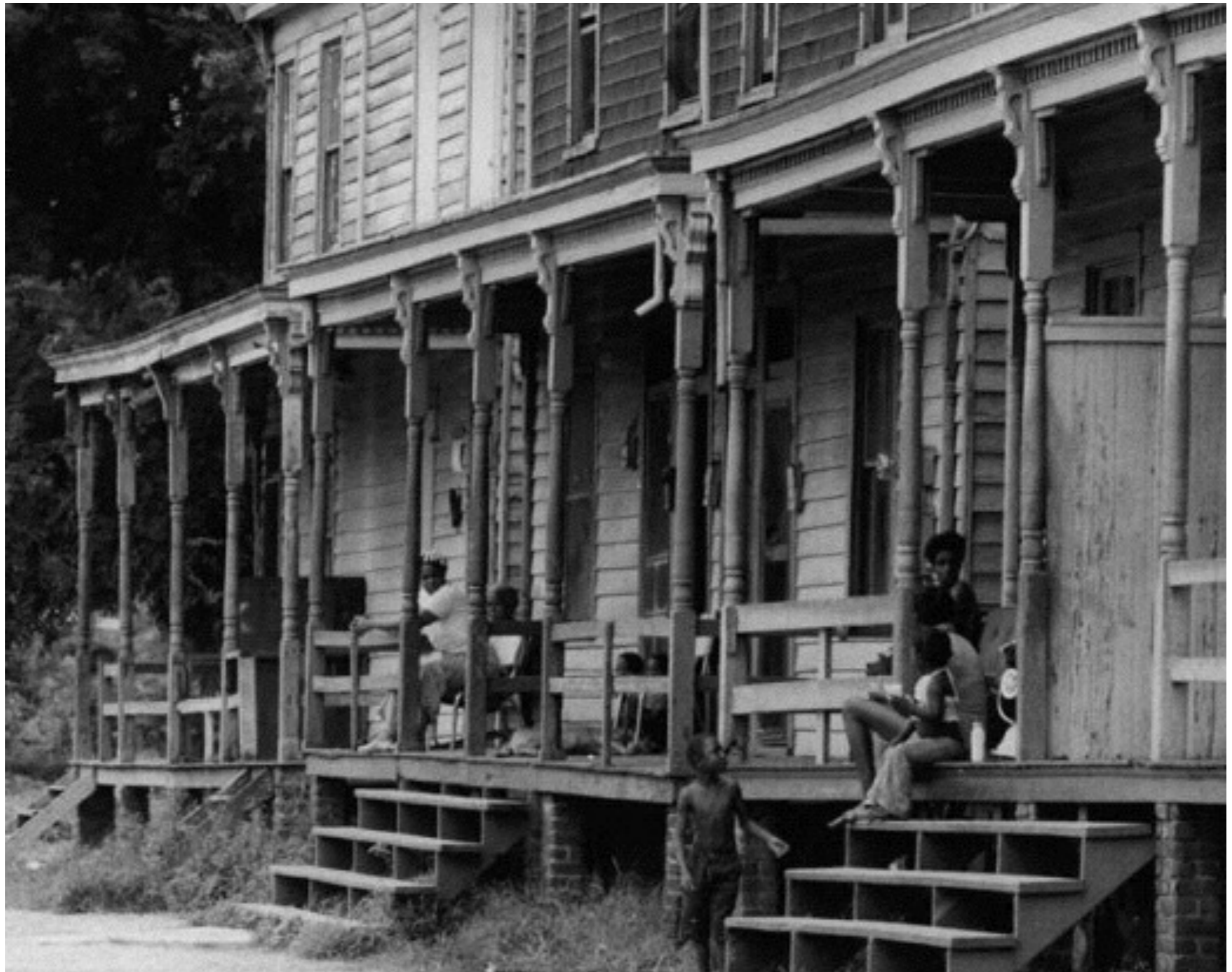
20th and O Streets (1974)