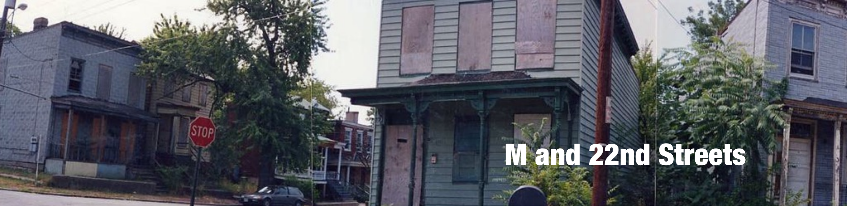
M and 22nd Streets