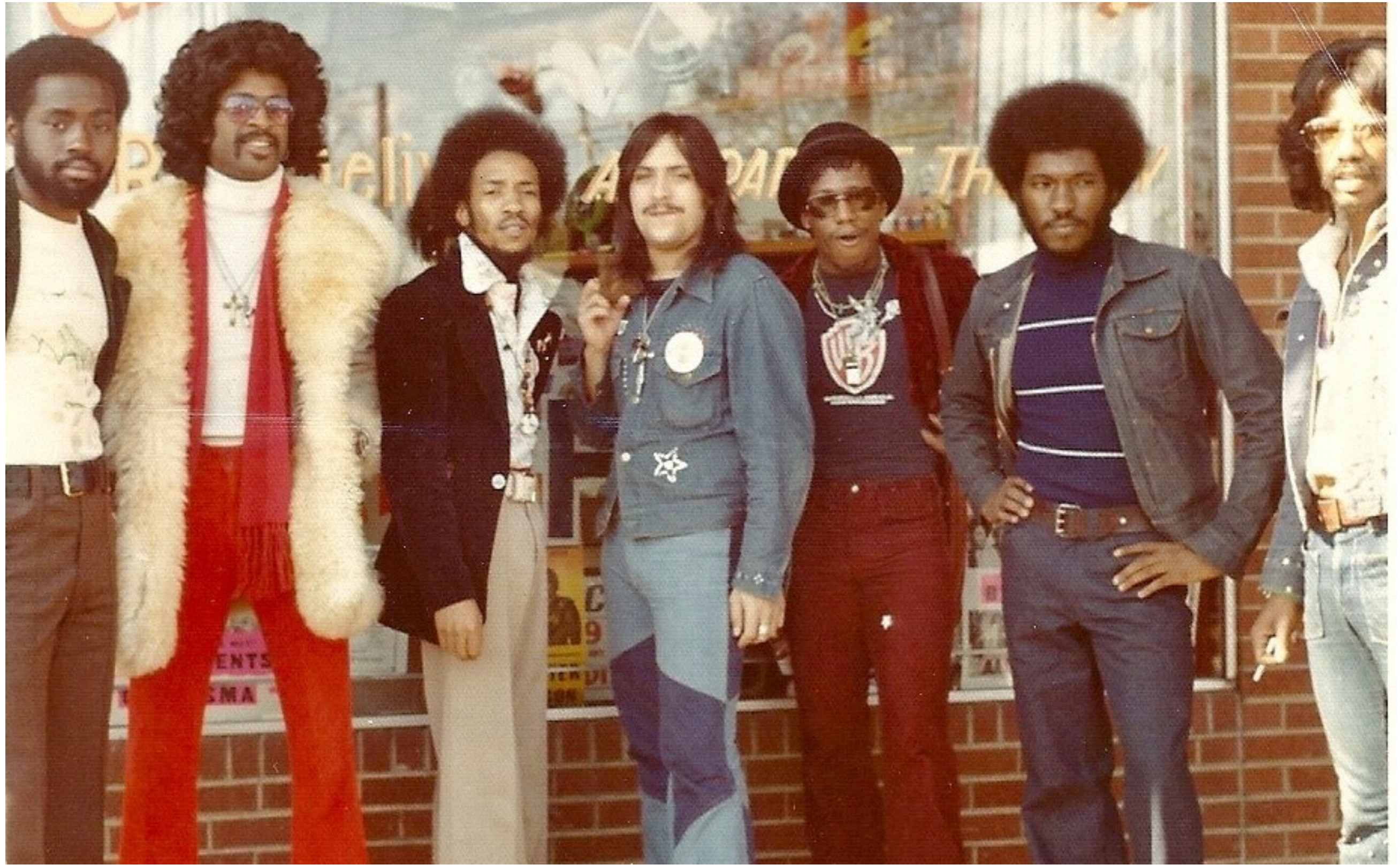
Church Hill Record Shop (1970s)