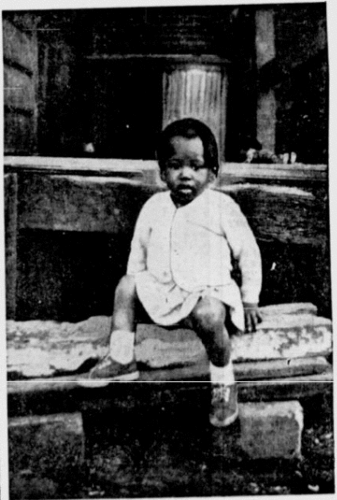
TOUGH CLIMB — A little girl sits on the makeshift backstairs of this slum house on Louisiana St. The distance between the two steps is almost as big as she is.