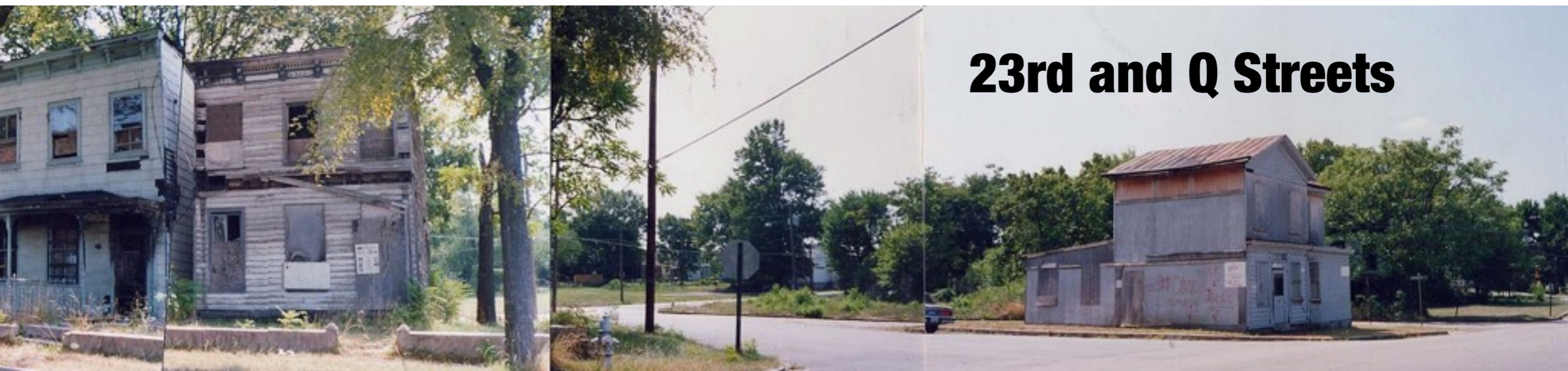
23rd and Q Streets