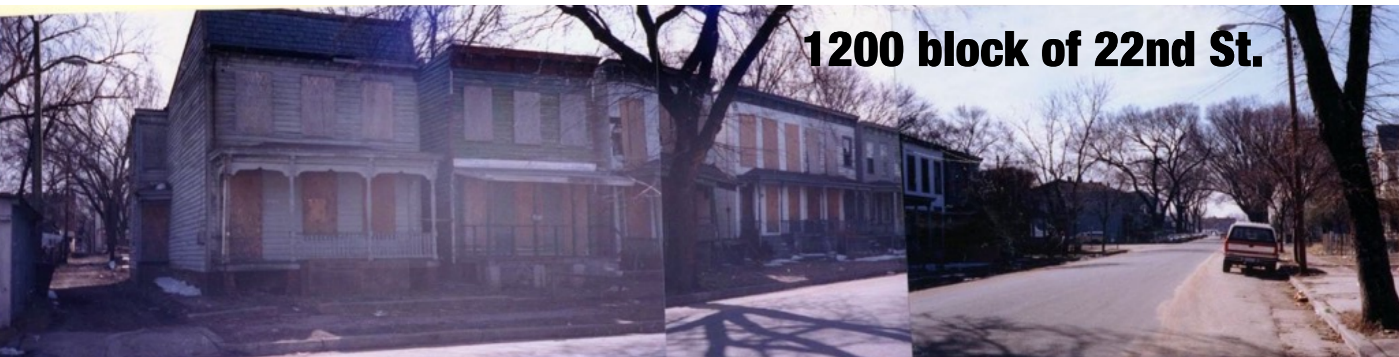
1200 block of 22nd St.