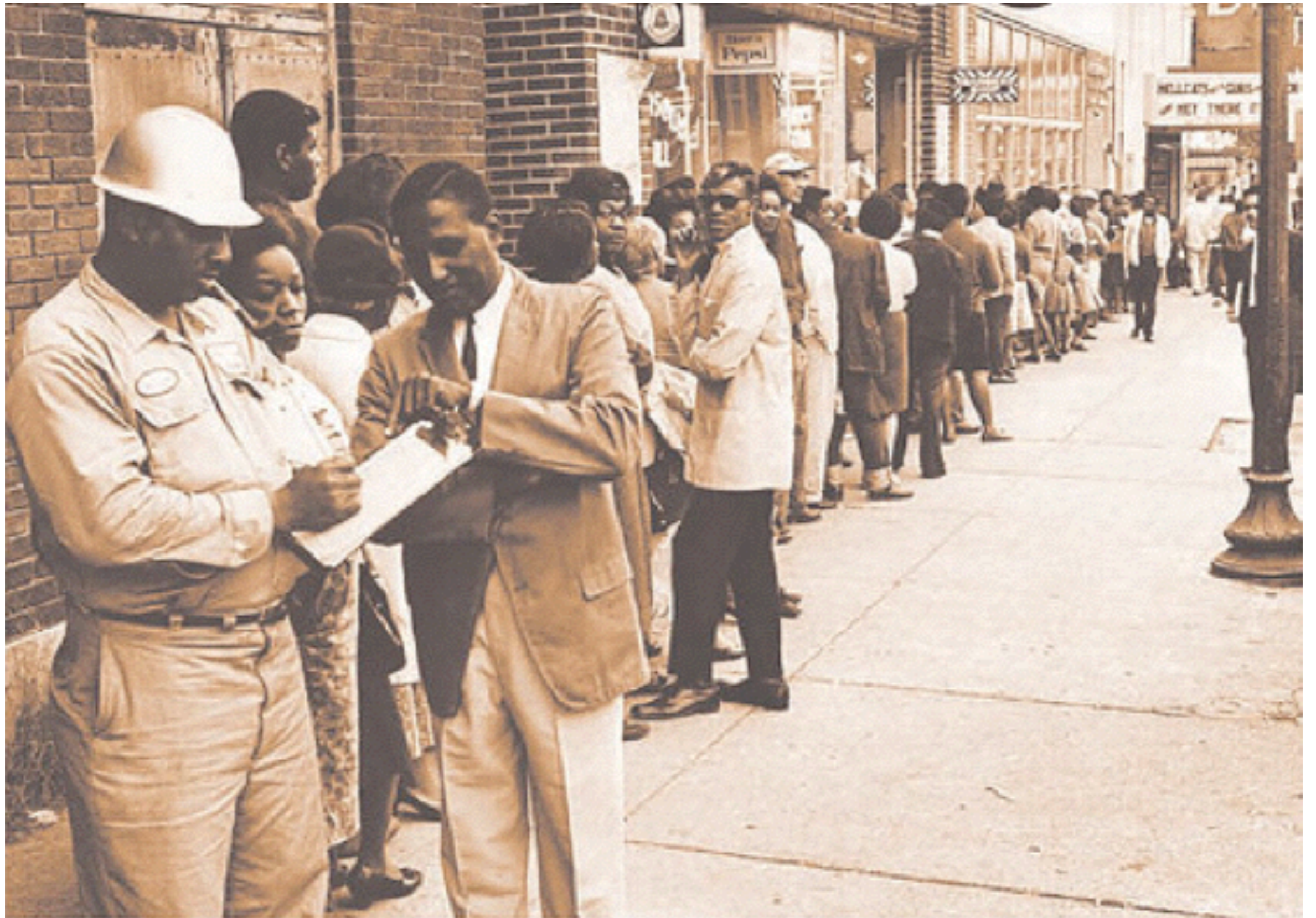
Voter registration drive on 25th Street (1964)