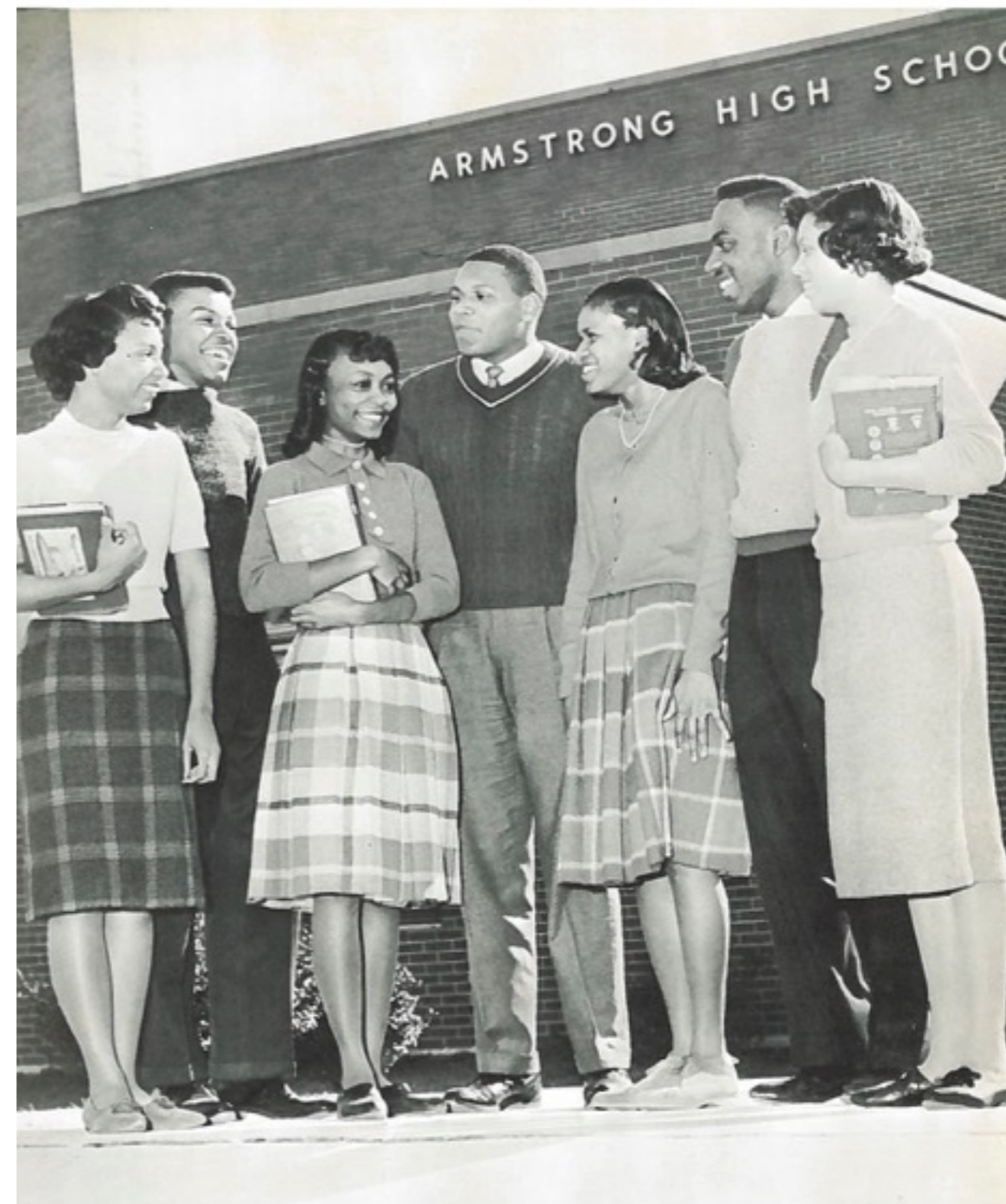
Membership in National Honor Society