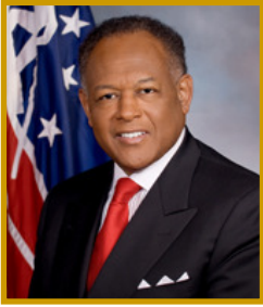
Mayor Dwight C. Jones