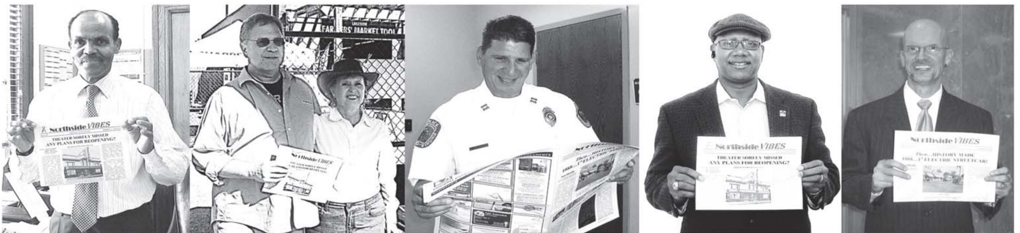
Richmond Community H.S. Lakeside Farmers' Market Richmond Police/4 th Precinct Nehemiah CDC City Council