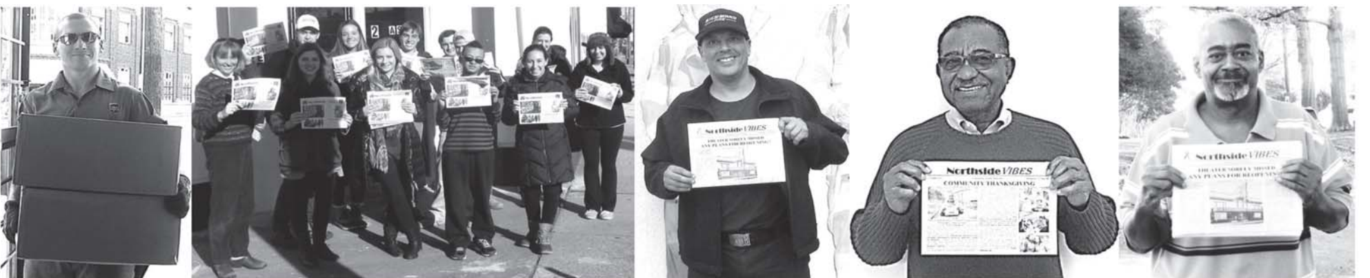
U.P.S. Journalism Students & Jr. Editor 4kids Fire Station #15 Rubicon Volunteer Delivery Rep.

New Team: Students from University of Richmond (picture above), Richmond Community High School, and Embraced by Wings (see front page)!