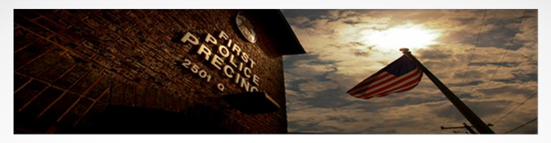
Sector 111 – May 2017